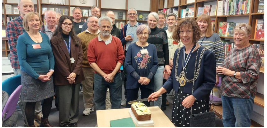
Celebrating RCK's first birthday in February 2024

The project mobilises community capacities and resources, builds relationships, trust, and collaboration.