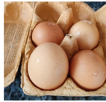
Photos, left to right: why we need a new shed; our 4 happy hens out at last; and the eggs they lay most days